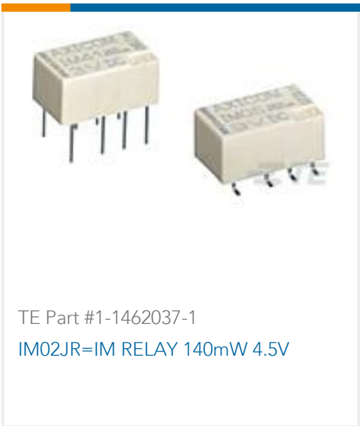
TE Part #1-1462037-1 IM02JR=IM RELAY 140mW 4.5V