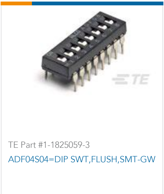
TE Part #1-1825059-3 ADF04S04=DIP SWT,FLUSH,SMT-GW