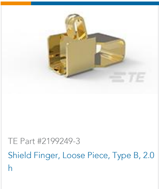
TE Part #2199249-3 Shield Finger, Loose Piece, Type B, 2.0h