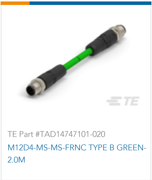
TE Part #TAD14747101-020 M12D4-MS-MS-FRNC TYPE B GREEN-2.0M