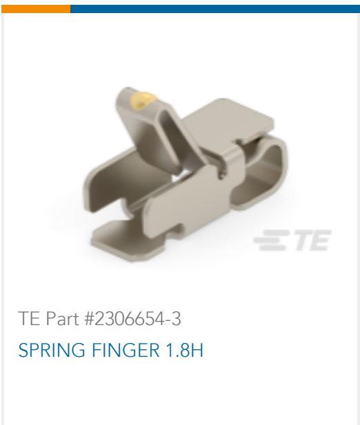
TE Part #2306654-3 SPRING FINGER 1.8H