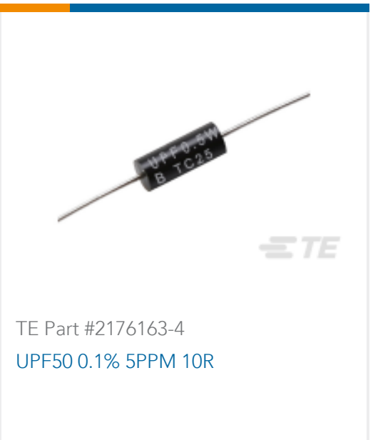
TE Part #2176163-4 UPF50 0.1% 5PPM 10R