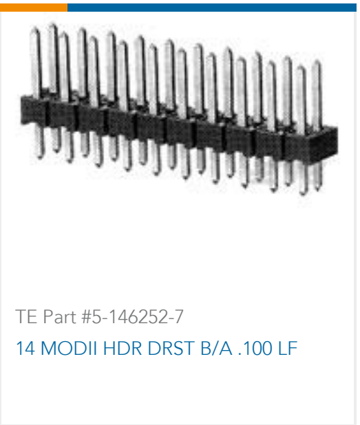
TE Part #5-146252-7 14 MODII HDR DRST B/A .100 LF