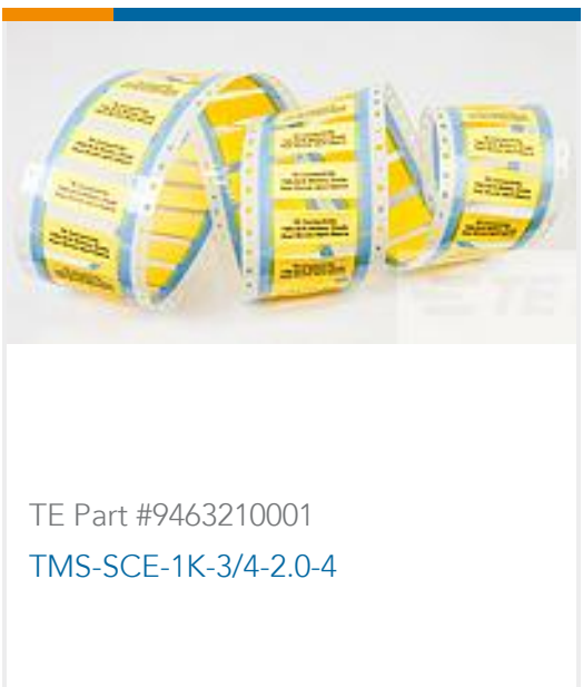
TE Part #9463210001 TMS-SCE-1K-3/4-2.0-4