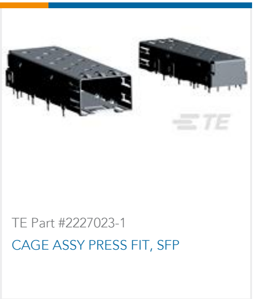
TE Part #2227023-1 CAGE ASSY PRESS FIT, SFP