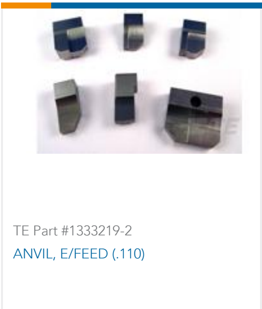
TE Part #1333219-2 ANVIL, E/FEED (.110)