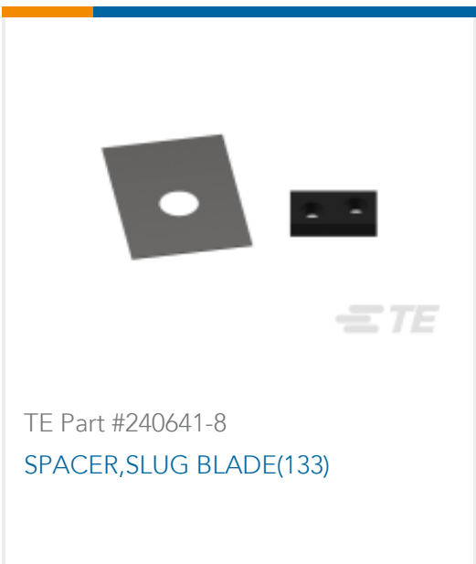
TE Part #240641-8 SPACER,SLUG BLADE(133)