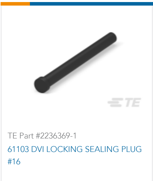
TE Part #2236369-1 61103 DVI LOCKING SEALING PLUG #16