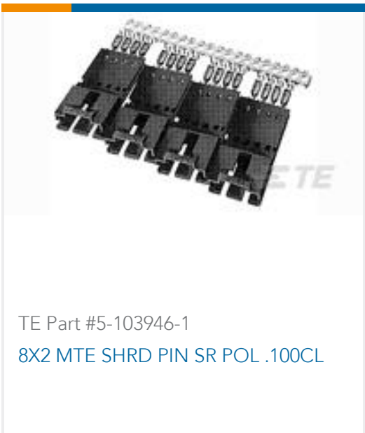
TE Part #5-103946-1 8X2 MTE SHRD PIN SR POL .100CL