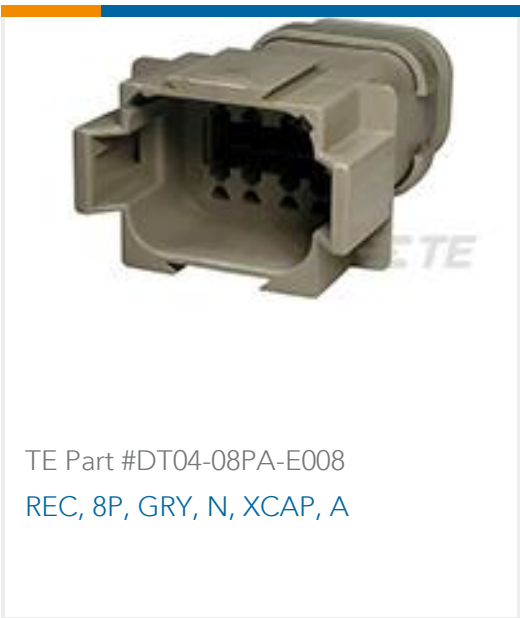
TE Part #DT04-08PA-E008 REC, 8P, GRY, N, XCAP, A