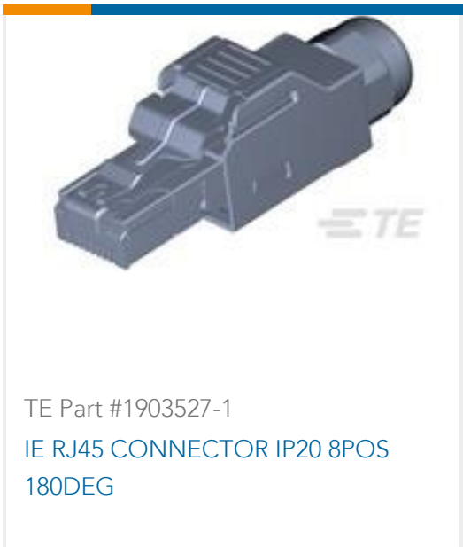
TE Part #1903527-1 IE RJ45 CONNECTOR IP20 8POS 180DEG