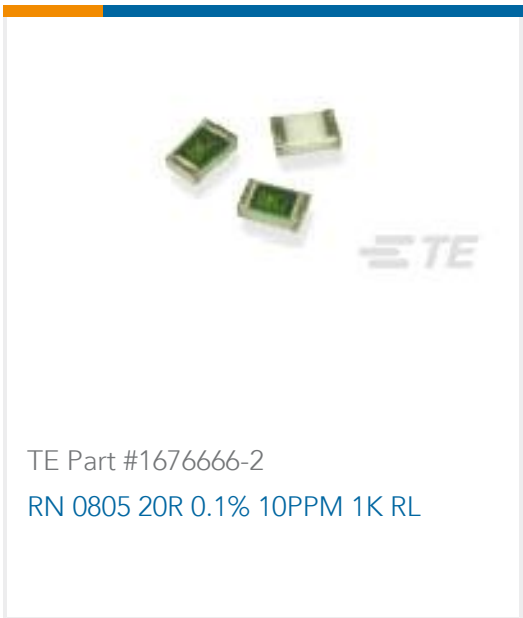
TE Part #1676666-2 RN 0805 20R 0.1% 10PPM 1K RL