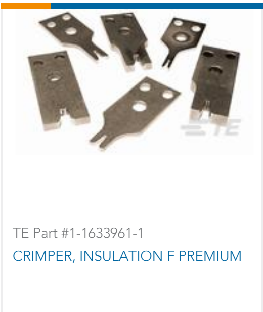
TE Part #1-1633961-1 CRIMPER, INSULATION F PREMIUM