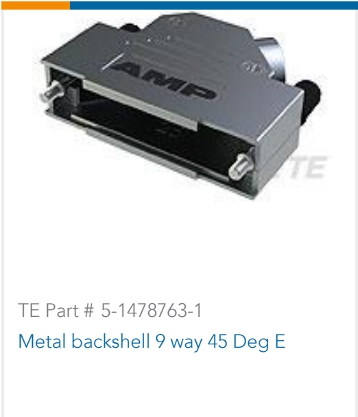
TE Part # 5-1478763-1 Metal backshell 9 way 45 Deg E