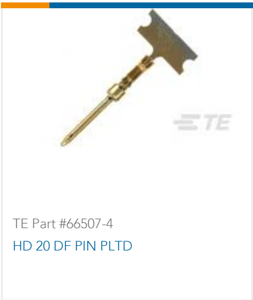
TE Part #66507-4 HD 20 DF PIN PLTD