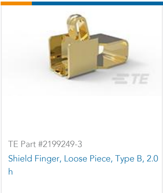
TE Part #2199249-3 Shield Finger, Loose Piece, Type B, 2.0 h